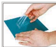
step 2: paste and remove the tape