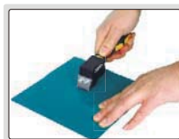
step 1: make grid cutting on surface